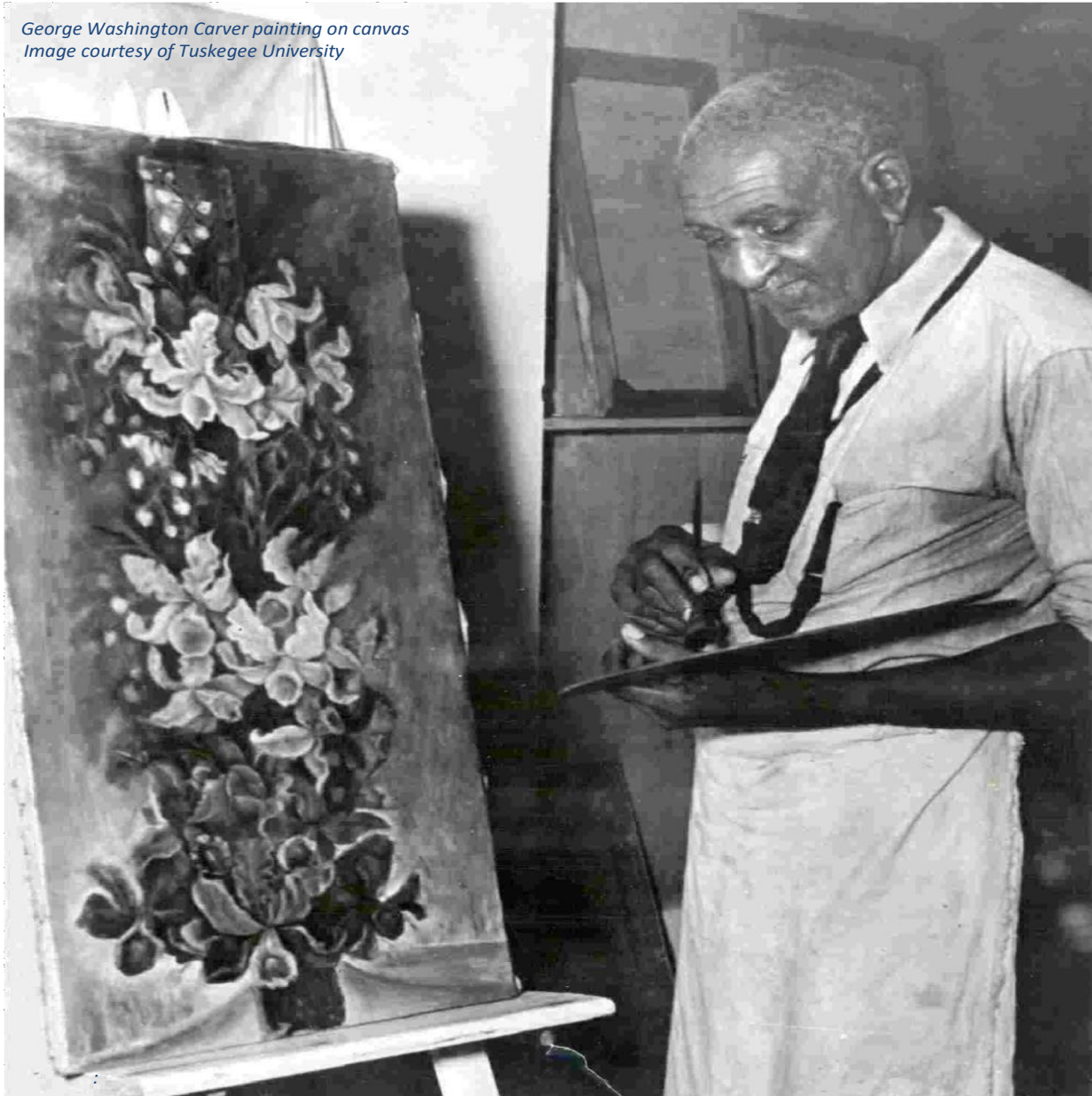
George Washington Carver painting on canvas